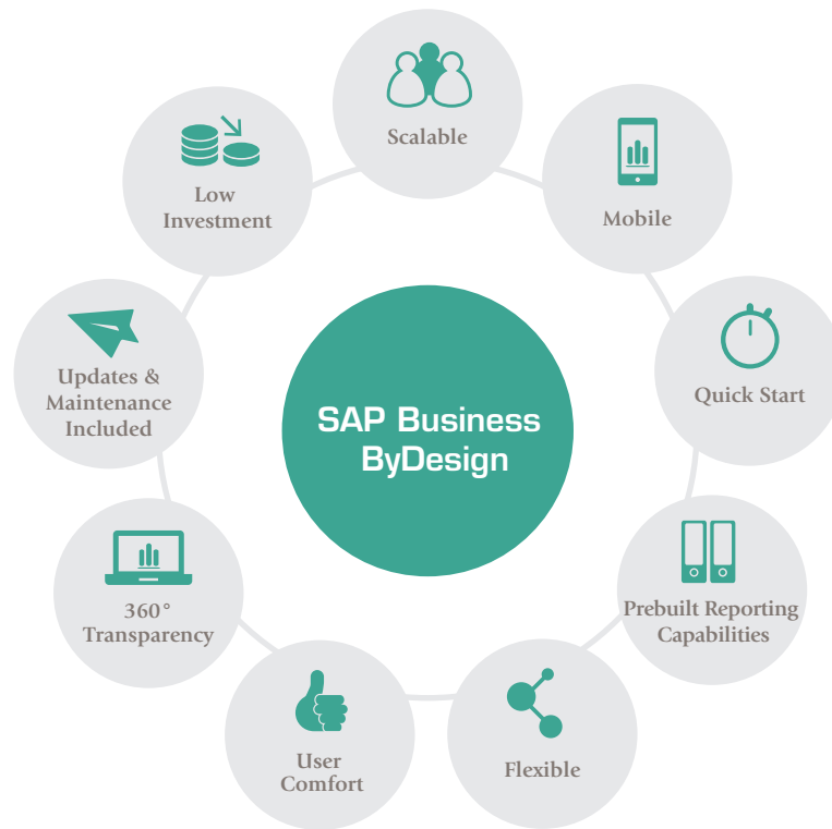
Figure 2: SAP Business ByDesign Provides All the Key Benefits of the Cloud and More