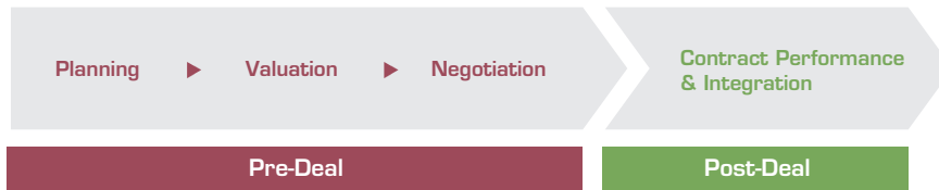
Figure 1: ERP From the Cloud Supports All Central M&A/Carve-Out Processes