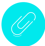
Website: Application Management Services